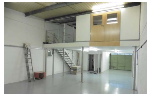
Photographs taken February 2017